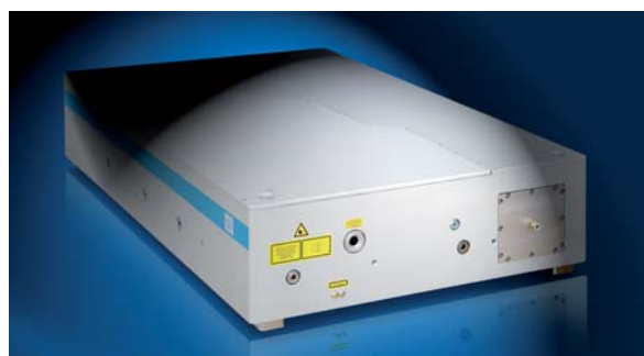
JenLas® ASAMA laser head